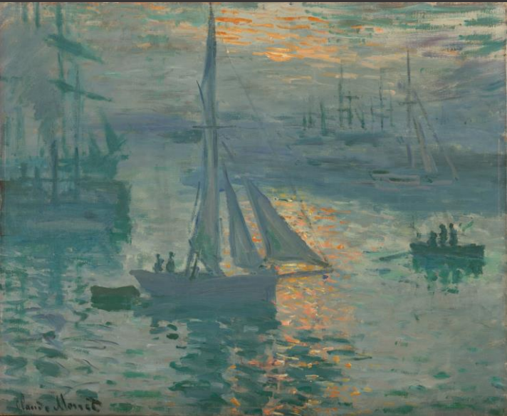
Sunrise (Marine) 1872 or 1873 Claude Monet Sold to the J.Paul Getty Museum 1998

Do you place greater value on the author, the subject matter, or the message when collecting the paintings or their reproductions?