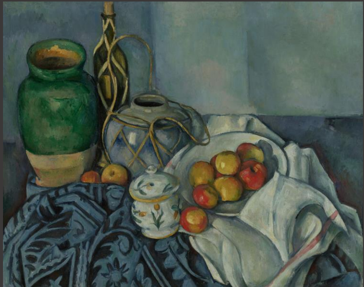
Still Life with Apples 1893-1894 Paul Cézanne Sold to the J.Paul Getty Museum 1996

What would be the equivalent of collecting painting in the domestic sphere? Do you have any posters or prints displayed in your home?